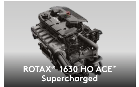
ROTAX® 1630 HO ACE™ Supercharged

Waterproof and shockproof compartment specifically designed for phone protection. 2