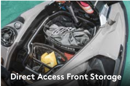
Direct Access Front Storage

Large front storage area that's easily accessible from a seated position. 1 Storage bin organizer included for ultimate convenience.