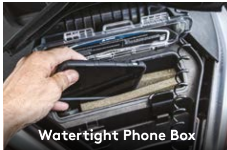
Watertight Phone Box

An innovative hull that sets the benchmark for rough water handling, stability, and offshore performance.