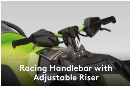
Racing Handlebar with Adjustable Riser

A narrow seat profile with deep knee pockets lets riders sit naturally and use the leg muscles to hold onto the machine for more control.