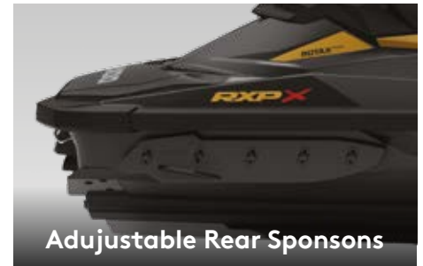
Adjustable Rear Sponsons

Limits bow rise and improves performance in all water conditions.