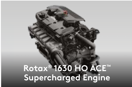
Rotax® 1630 HO ACE™ Supercharged Engine

The Rotax® 1630 HO ACE™ Supercharged is the most powerful Rotax® engine ever, delivering high efficiency and the best-in-class acceleration.