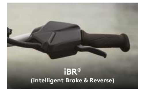
Exclusive to Sea-Doo<sup>®</sup>, iBR<sup>®</sup> stops the watercraft sooner and provides more control and maneuverability at low speeds and in reverse.