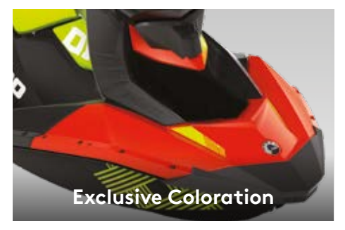
Exclusive TRIXX<sup>™</sup> coloration.

©2019 Bombardier Recreational Products Inc., (BRP). All rights reserved. TM, © and the BRP logo are trademarks of Bombardier Recreational Products Inc. or its affiliates. Products are distributed in the USA by BRP US Inc. Never perform tricks with a passenger. Do not attempt if beyond your skills level and experience. All product comparisons, industry and market claims refer to new sit down PWC with 4-stroke engines. Watercraft performance may vary depending on, among other things, general conditions, ambient temperature, and altitude, riding ability and inder/passenger weight. Because of our ongoing commitment to product quality and innovation, BRP reserves the right at anytime to discontinue or change specifications, price, design, features, models or equipment without incurring any obligation. Printed in Canada. ‡ Bluetooth is a registered trademark owned by Bluetooth SIG, Inc. and any use such marks by BRP is under iscense.