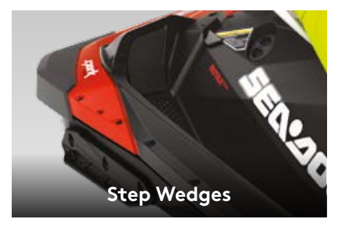
Provides enhanced stability and confidence in different riding positions making it easier to pull off tricks like a pro.